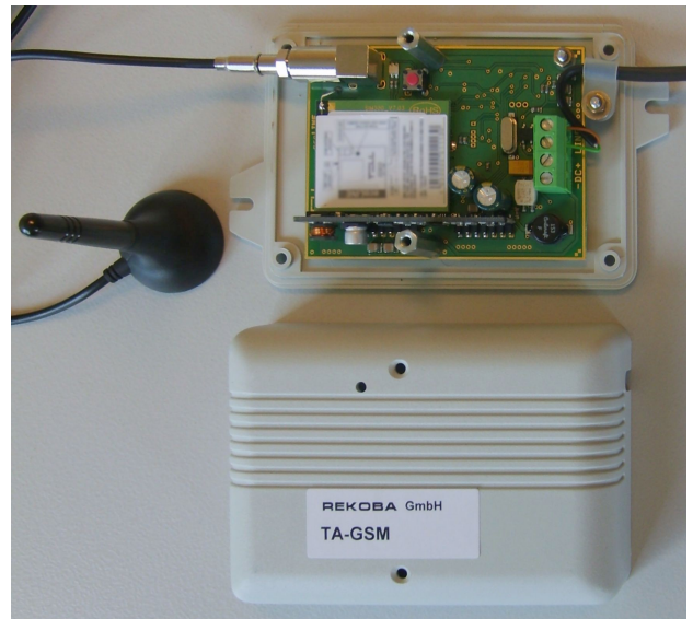
Fig. 1.: Product image (opened)